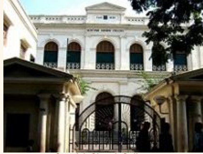
Scottish Church College Urquhart Square, Kolkata, India

It deserves to be noted here that contrary to what he came to expect of his disciples later on, Bhaktivedanta Swami himself was never sent away from his parents at age 5 or younger to attend a gurukula and never did so with any of his own children. As a married man he also never lived under the direct control of his guru [SB 7.12.11 and SB 7.12.1, Vrindavana, April 12, 1976].