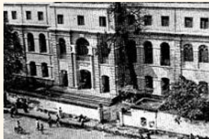
Mutty Lall Seal's Free School

Everyone's viewpoints are colored by their own past and upbringing. Taking Bhaktivedanta Swami's cultural and family background into consideration may help put some of his attitudes towards women into perspective.